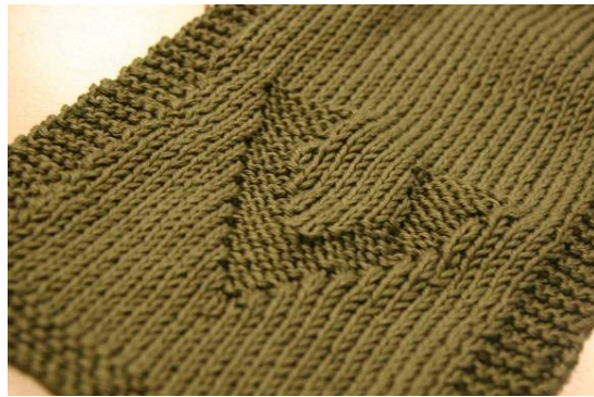
2007 Knit your Bit Scarf Pattern

http://www.nationalww2museum.org/education/crochetpattern2006.pdf