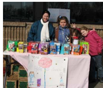
Brownie Troop 5462 at a Glenolden Pathmark cookie booth in 2009.

Girl Scout cookies freeze well, so stock up while they're available!